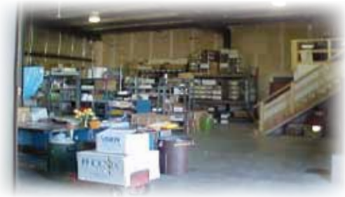
HIGH CEILINGS-IDEAL FOR RACKING