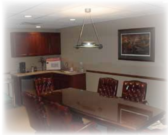
SOPHISTICATED OFFICE SPACE WITH CUSTOM DESIGNED CONFERENCE AREAS.

ABSOLUTELY UNIQUE, CUSTOM-DESIGNED OFFICE/INDUSTRIAL FLEX BUILDING FOR SALE IN CRYSTAL LAKE. THIS HIGH- QUALITY BUILDING FEATURES UPSCALE EXECUTIVE OFFICES, ELEGANT BOARDROOMS WITH DESIGNER LIGHTING & WET BAR, HIGH CEILINGS, GREAT LIGHTING, NEARLY 1500 SF OF AIR-CONDITIONED MEZZANINE LOFT OFFICE SPACE. THIS BUILDING COMES COMPLETE WITH RECEPTION AREAS, WET PANTRIES, OFFICE STORAGE, CLOSETS, & MULTIPLE UTILITY CLOSETS FOR EXTRA STORAGE. THIS SPACE WITH SECURITY SYSTEM CAN BE DELIVERED FULLY-FURNISHED WITH DESKS, FILE CABINETS, CONFERENCE TABLES & CHAIRS, ETC. (FOR AN ADDITIONAL COST) AND IS FULLY WIRED AND DESIGNED FOR EFFICIENCY & COMFORT.