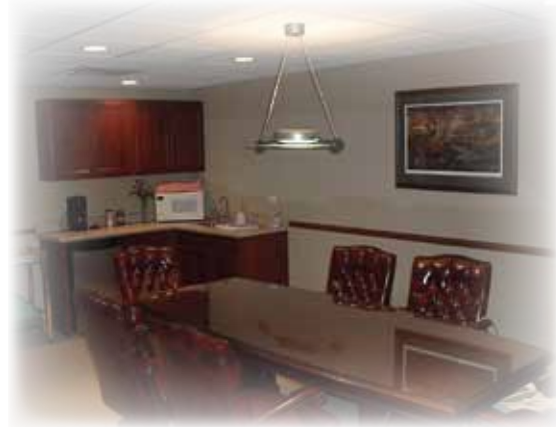
SOPHISTICATED OFFICE SPACE WITH CUSTOM DESIGNED CONFERENCE AREAS.

THIS SPACE COMES COMPLETE WITH A RECEPTION AREA, WET PANTRY, OFFICE STORAGE CLOSET, & MULTIPLE UTILITY CLOSETS FOR EXTRA STORAGE. THIS "MOVE-IN" READY SPACE WITH SECURITY SYSTEM & CAN BE DELIVERED FULLY-FURNISHED WITH DESKS, FILE CABINETS, CONFERENCE TABLES & CHAIRS, ETC. (AT REQUEST OF TENANT & FOR AN ADDITIONAL FEE). SPACE IS FULLY WIRED, AND DESIGNED FOR EFFICIENCY, & COMFORT.